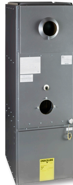
HTL (Up Flow Only)